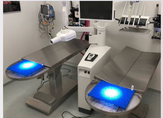
A-vet Smådyrklinikk, Norway